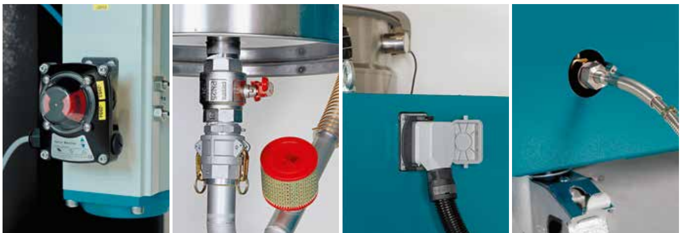
Left: Pressure conveying shut-off valve on the impregnating unit